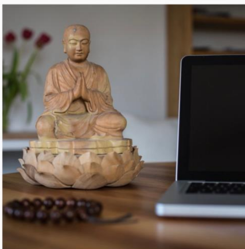
Wired for Enlightenment